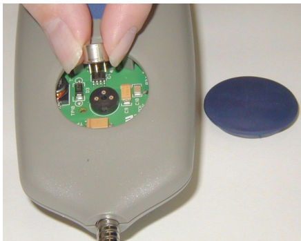
Figure 2. Installing the Sensor