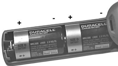
Figure 1. Properly Installed Alkaline Batteries

When the batteries reach the end of their life, the green Low Battery indicator will start flashing. While the batteries may operate the TEK-Mate up to one hour after the Low Battery indicator starts flashing, the batteries should be replaced as quickly as possible.